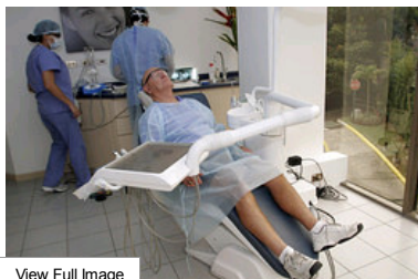
View Full Image

Dr. Emanuel's assessment of American medical care is summed up in a Nov. 23, 2008, Washington Post op-ed he co-authored: "The United States is No. 1 in only one sense: the amount we shell out for health care. We have the most expensive system in the world per capita, but we lag behind many developed nations on virtually every health statistic you can name."